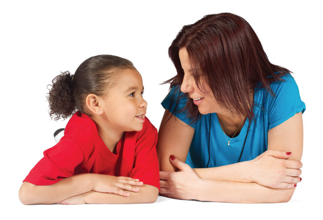
The YMCA wants all children to be safe. Unfortunately, child abuse does exist, taking many forms.